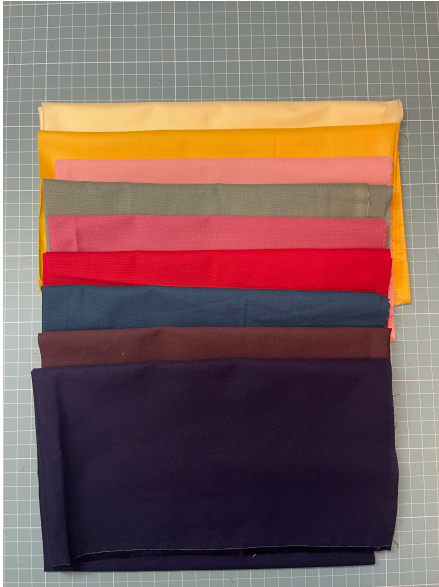
9 different hues going from light to dark